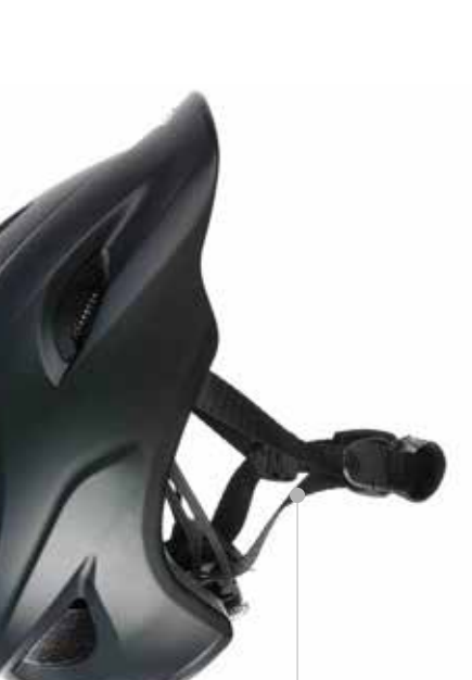
Nylon belts with splitter adjusting size and helmet conditioning